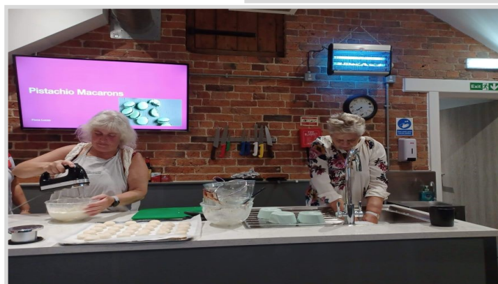
Wragby cooking up a storm