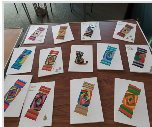
"Iris Folding" greetings cards at Washingborough