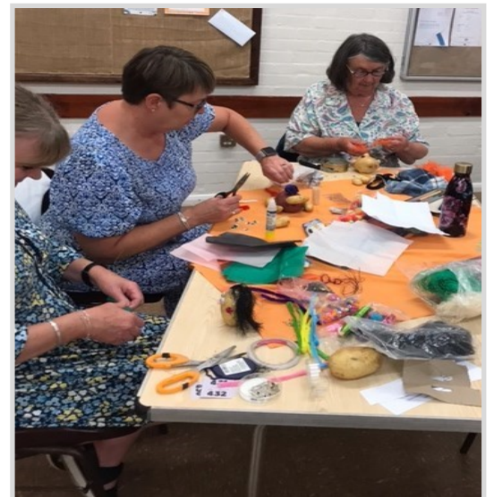
Tetney's potato figures