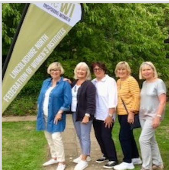
South Reston detectives