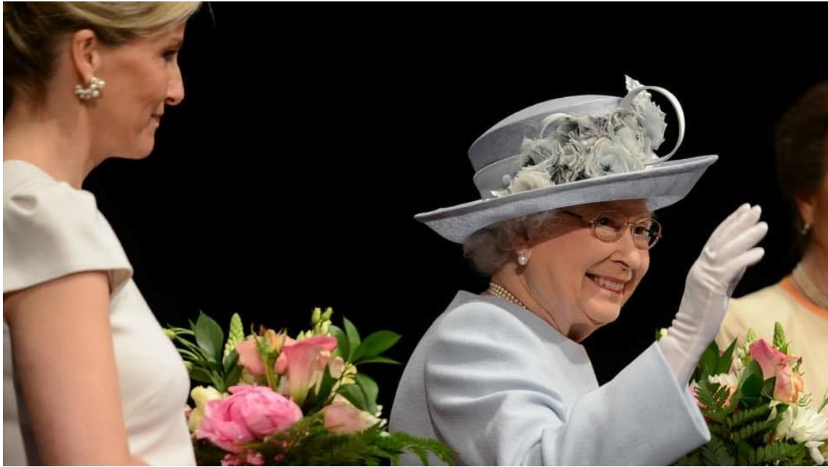
Her Majesty Queen Elizabeth II