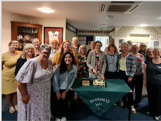
Skegness's 10th birthday